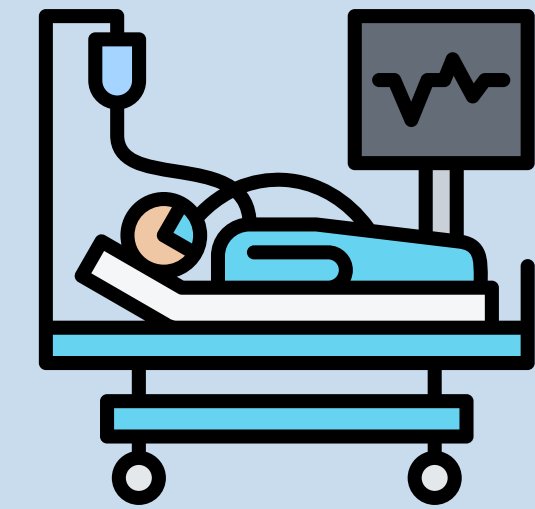
Patients in Intensive Care Unit