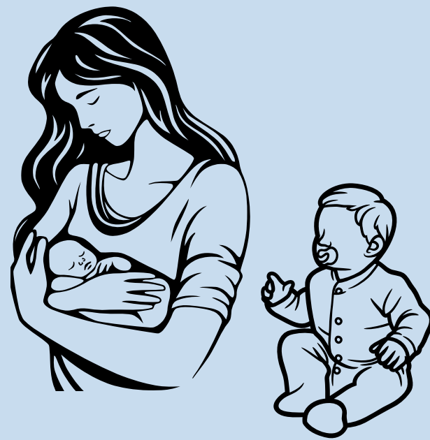
Babies and children