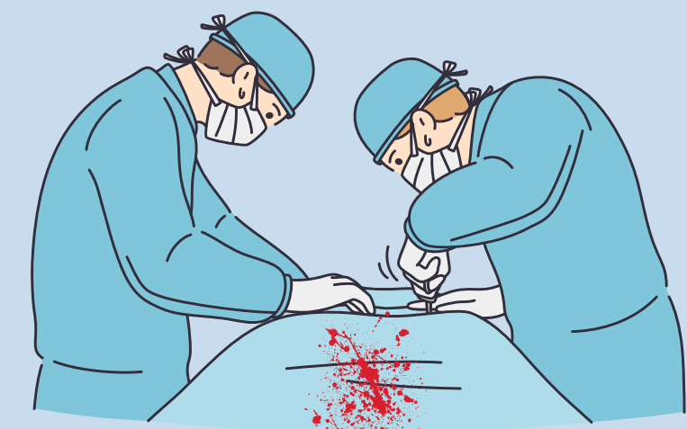
Blood loss or surgical blood loss