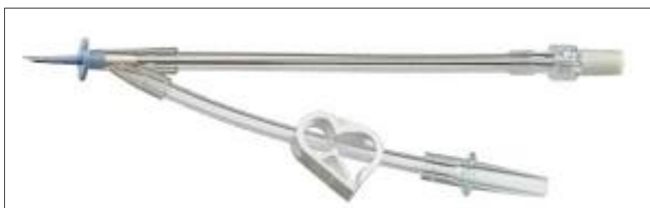
Figure 2. DLP cannula

Once the DLP cannula is in place and open to air, the cardiothoracic surgeon announces that the aortic arch is vented, at which point the NRP pump may begin. The time will be recorded on the National DCD Heart Passport. If there is copious arterial bleeding from the DLP cannula, the NRP pump must stop and the clamp on the descending aorta must be re-positioned to occlude the aorta. Only then can the NRP pump re-start.