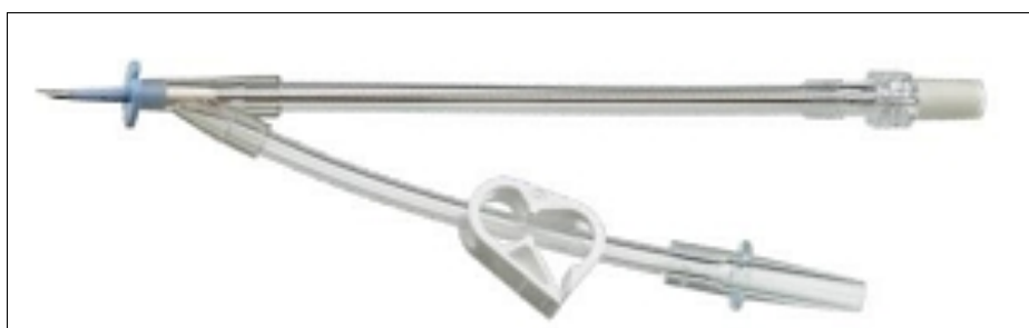
Figure 2. DLP cannula

Once the DLP cannula is in place and open to air, the cardiothoracic surgeon announces that the aortic arch is vented, at which point the NRP pump may begin. The time will be recorded on the National DCD Heart Passport. If there is copious arterial bleeding from the DLP cannula, the NRP pump must stop and the clamp on the descending aorta must be re-positioned to occlude the aorta. Only then can the NRP pump re-start.