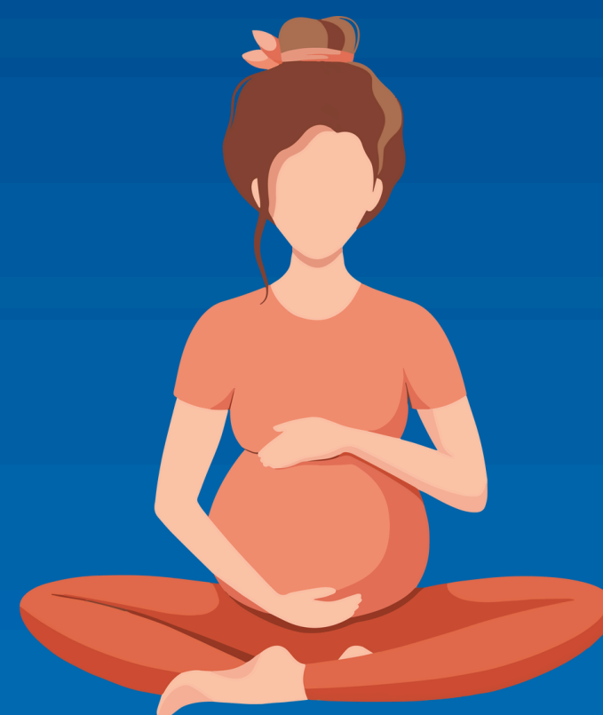
Elective transfusion during pregnancy NOT during labour and delivery