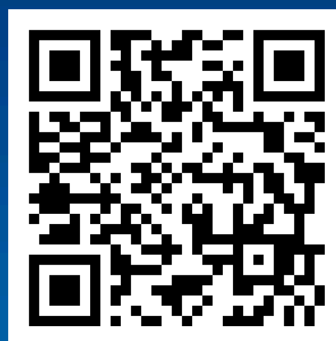
Blood Assist web-based application