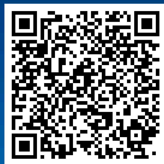
CMV negative components: fact sheet for clinicians