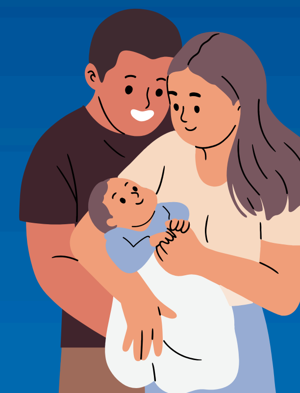
Neonatal transfusion up to 28 days post EDD