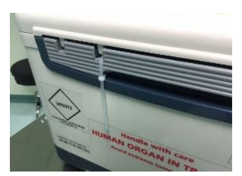
Close latch hole in latch and secure the tie (place finger behind tie to ensure you do not over-tighten)- see pictures below.