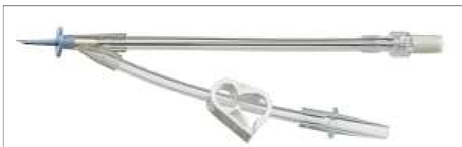
Figure 2. DLP cannula

Once the DLP cannula is in place and open to air, the cardiothoracic surgeon announces that the aortic arch is vented, at which point the NRP pump may begin. The time will be recorded on the National DCD Heart Passport. If there is copious arterial bleeding from the DLP cannula, the NRP pump must stop and the clamp on the descending aorta must be re-positioned to occlude the aorta. Only then can the NRP pump re-start.