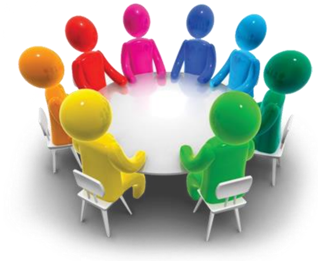
Table Top Discussions: Pathways