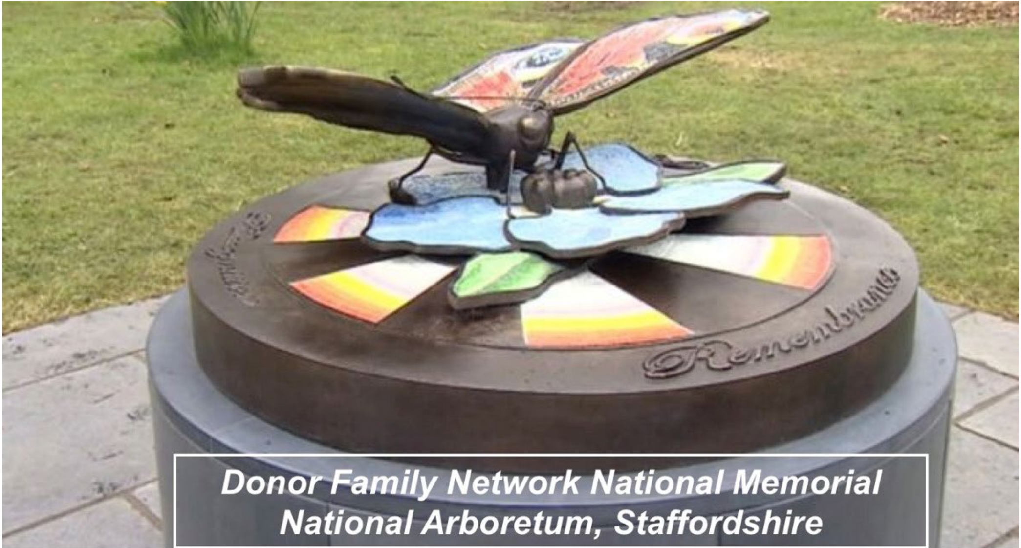
Donor Family Network National Memorial National Arboretum, Staffordshire