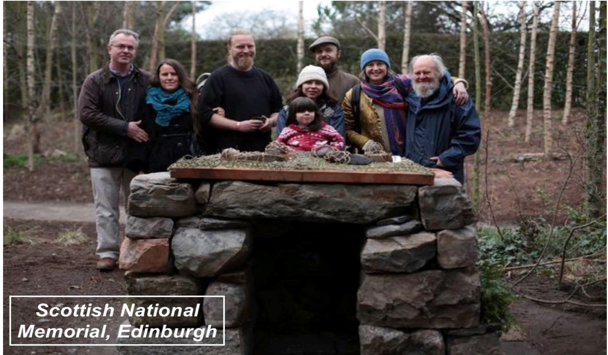
Scottish National Memorial, Edinburgh