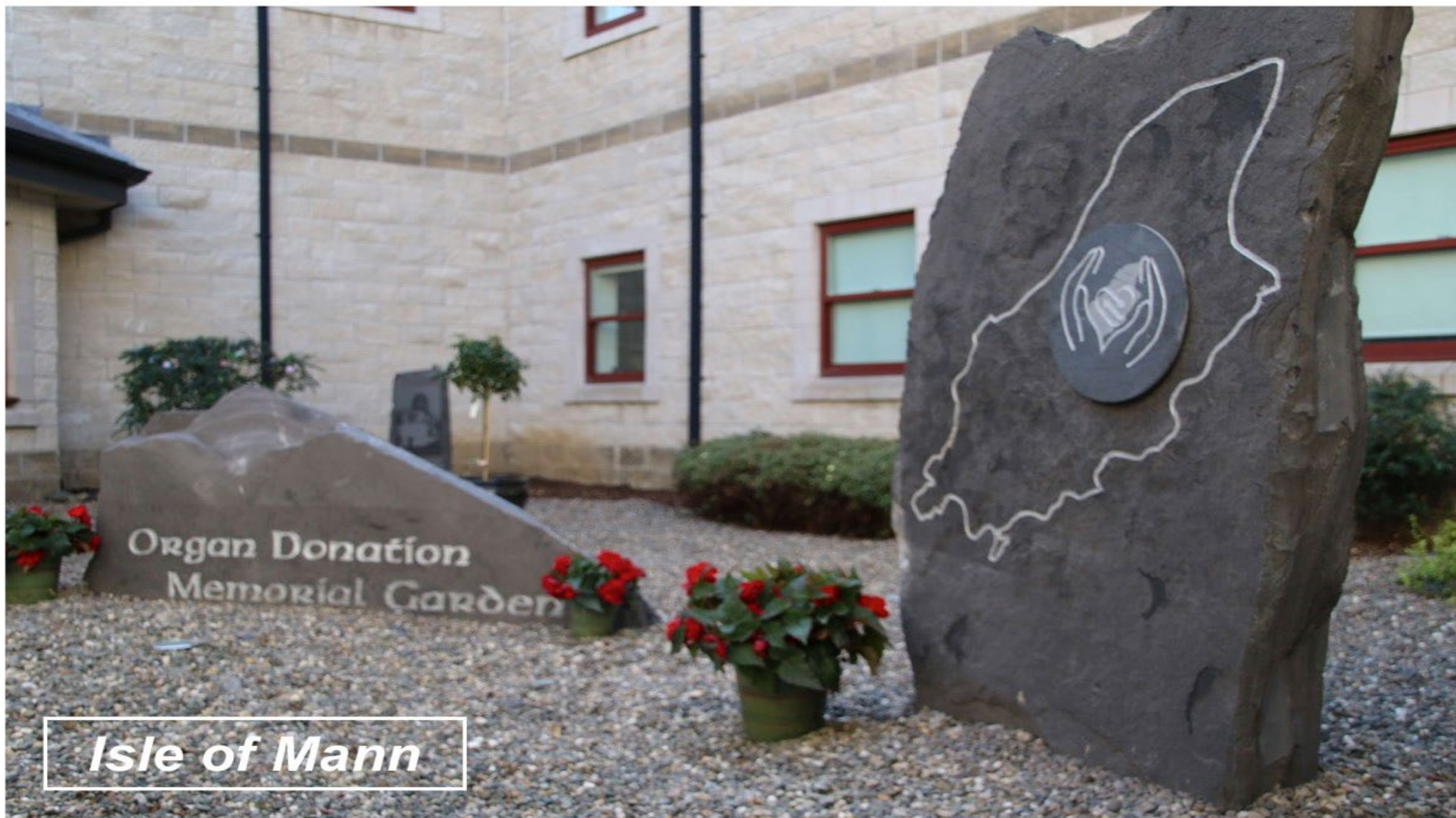
Isle of Mann