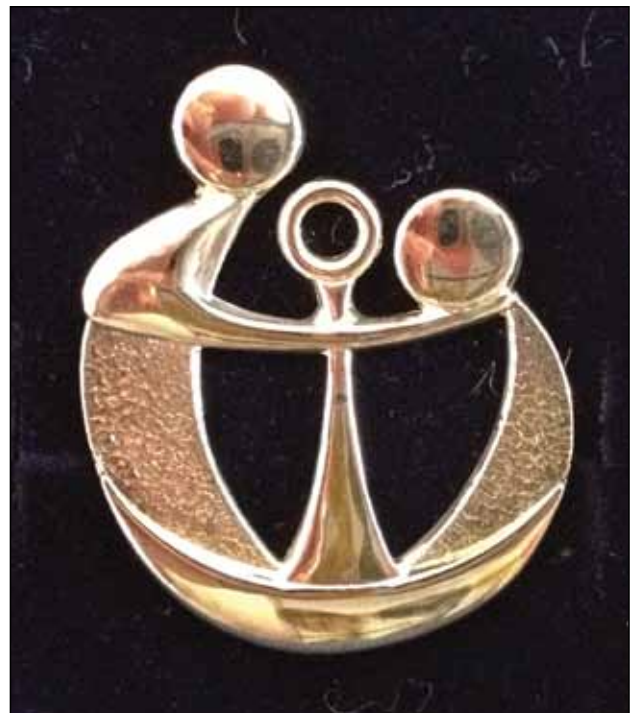
The silver donor pin originated in Nottingham City Hospital and was adopted by NHSBT. It is sent to every living organ donor in recognition of the gift of donation.

LDKT 2020 builds on the strengths of the previous strategy to continue the safe and sustainable expansion of the living donor pool with the aim of increasing LDKT to 26 transplants per million population, matching world class performance. More patients and their families will benefit from transplantation and it will be possible to offer transplants to patients with complex needs who might not otherwise get a transplant. The NHS will also benefit as more people are transplanted before entering the kidney dialysis programme, thus reducing costs overall. Successful implementation of the plan will be dependent upon the active engagement of all members of the wider transplant community.